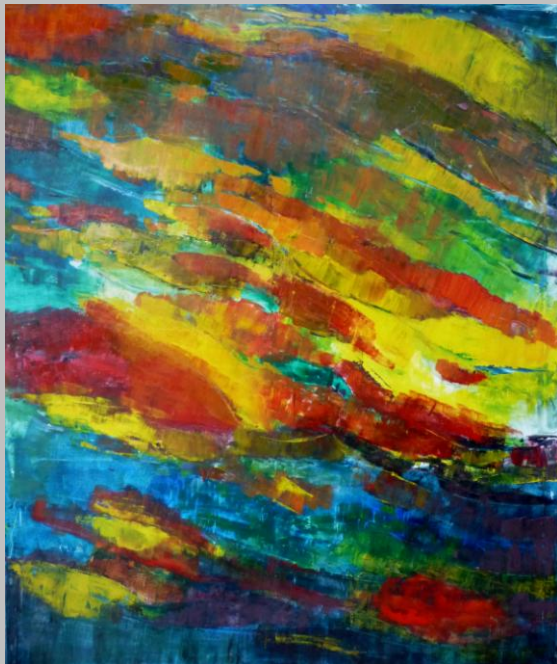
Swimmers (125 x 150 cm acrylics)