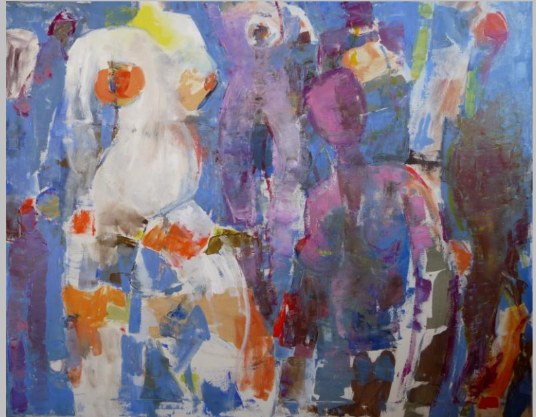
Together (100 x 80 cm acrylics)

In zonation painting, I search for beauty, aesthetics, a higher form. I make no distinction between abstract and figurative art. What counts in zonation painting is the pictorial organisation by virtue of neo-cubistic shapes, chromatic modulations and variations in brush strokes which unify the entire composition, in a continuous process of reconciling multiplicity with an overall unity. By researching hydrology and the psychological aspects of organisation, my great inspiration is the “waterworld-in-the-mind”. Girls in the Cybergallery , Together , Swimmers (next page) and CPH rain (last page) - are outcomes of this passion.