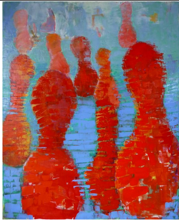
Organizations are bricks without mortar (80x100 cm)